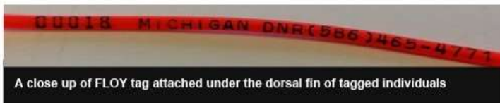
A close up of FLOY tag attached under the dorsal fin of tagged individuals