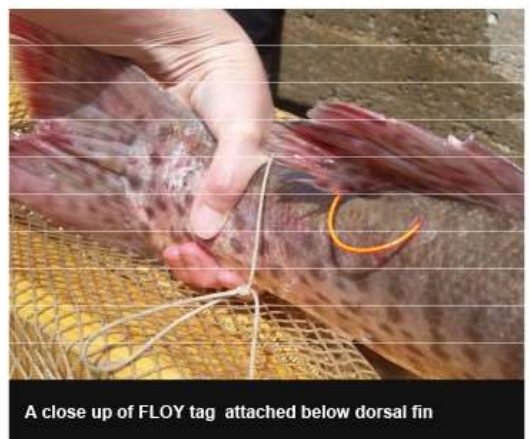
A close up of FLOY tag attached below dorsal fin