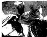
Volunteer cleaning boat propeller Ann Arbor

Invasive aquatic animals and plants are spreading at alarming rates by hitching rides with anglers and boaters. Whenever boaters leave a body of water without cleaning their recreational equipment, they may be transporting one of these harmful creatures from one lake or stream to another. A few invasive species are highlighted in this brochure.