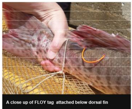
A close up of FLOY tag attached below dorsal fin