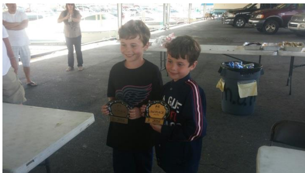
The Bennett boys showing dad how to catch um!