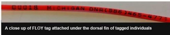
A close up of FLOY tag attached under the dorsal fin of tagged individuals