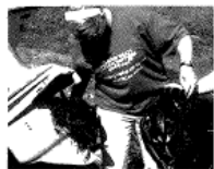
Volunteer cleaning boat propeller Ann Arbor

Invasive aquatic animals and plants are spreading at alarming rates by hitching rides with anglers and boaters. Whenever boaters leave a body of water without cleaning their recreational equipment, they may be transporting one of these harmful creatures from one lake or stream to another. A few invasive species are highlighted in this brochure.